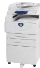
WorkCentre 5020DN shown with Duplex Automatic Document Feeder, optional Tray 2 and Stand

UL – 60950 – 1 / CSA – 60950 – 1 – 03, CE Mark applicable to Directives 2006 / 95 / EC, 2004 / 108 / EC, 1999 / 5 / EC